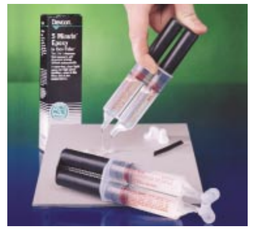
Devcon's new Dev-tube adhesive dispenser features a safer, easier-to-use design. its unique snap-open safety cap eliminates the need for a knife or razor to open it, while preserving unused adhesive for the next job. Other features include a convenient, snap-out mixing paddle moulded into the plunger handle.

A toughened structural adhesive formulated for bonding dissimilar substrates. Highly resistant to hydrocarbon fuels (gasoline, jet fuel, motor oil, hydraulic oil). Bonds PVC, fibreglass, ABS, steel, acrylics, polycarbonate, polyesters (PET; PBT), wood and ceramics. The final adhesive bond is designed to be load bearing and resistant to weathering, humidity and a wide variation in temperature.