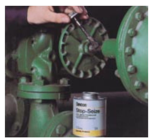
Threaded fittings are protected against sealing and locking with Stop Seize high temperature lubricant.