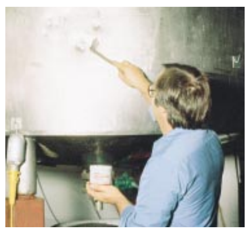
Stainless Steel Putty is ideal for making non-rusting repairs to stainless steel food processing equipment.