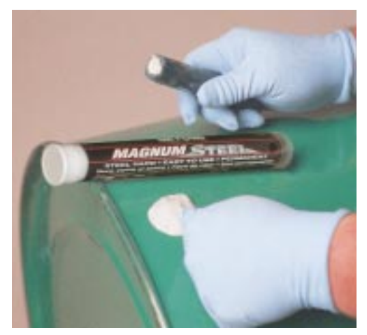
Keep several Magnum Epoxy Repair Sticks in your tool box for fast convenient repairs that can even be made under water and that harden in minutes.