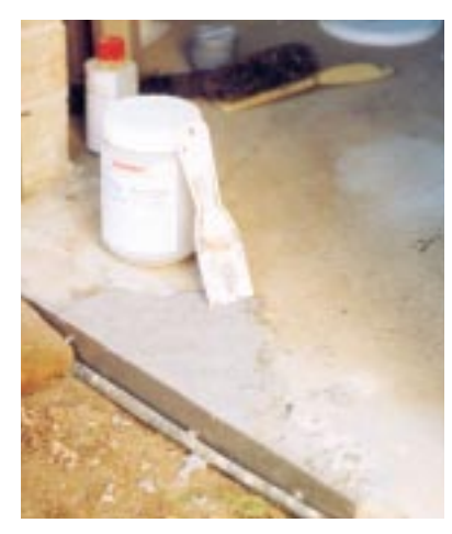
Floor Patch is easily applied and can be coloured to match the surrounding surface.