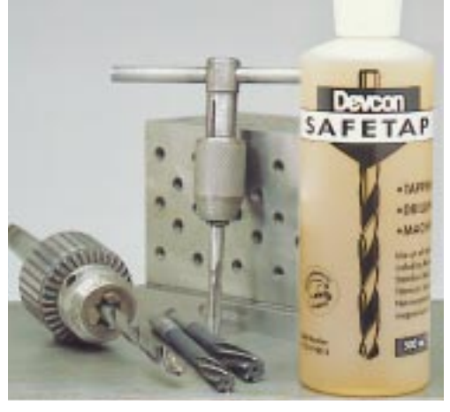
Safetap liquid - helping you work with metals and plastics safely.