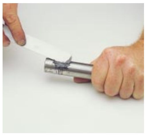
Use Plastic Steel S-5 to fill a damaged shaft prior to fitting a speedy sleeve.