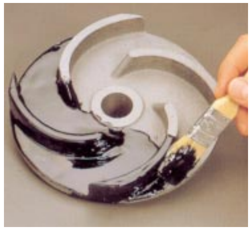
Flexane Brushable is an easily appliable finish that will protect your equipment from wear and corrosion