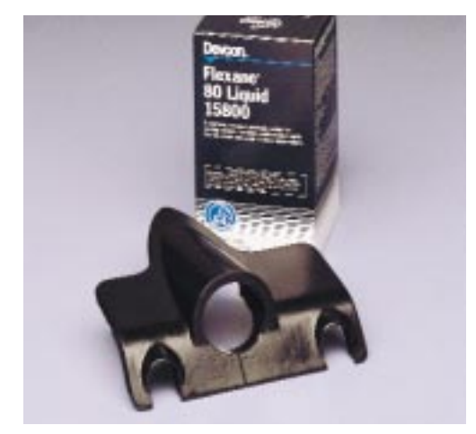
Use Flexane Liquids to mould small, quantities of rubber parts easily and economically.