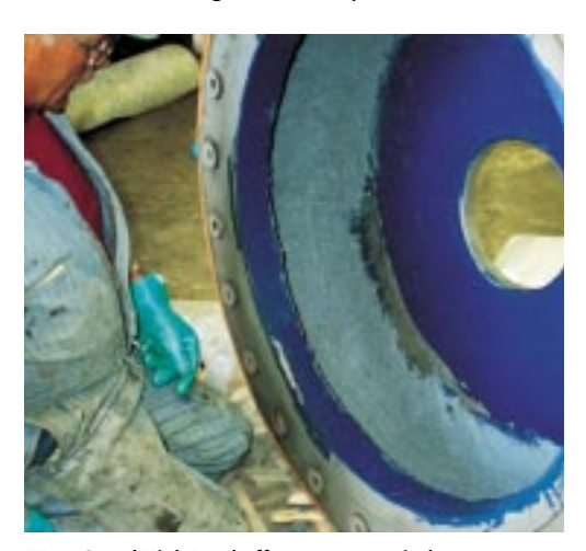
Wear Guard High Load offers an economical way to protect equipment surfaces from abrasion damage caused by particulate greater than 3mm.