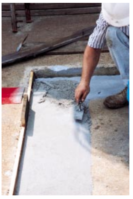
Foor Patch is also ideal for doing larger repairs.