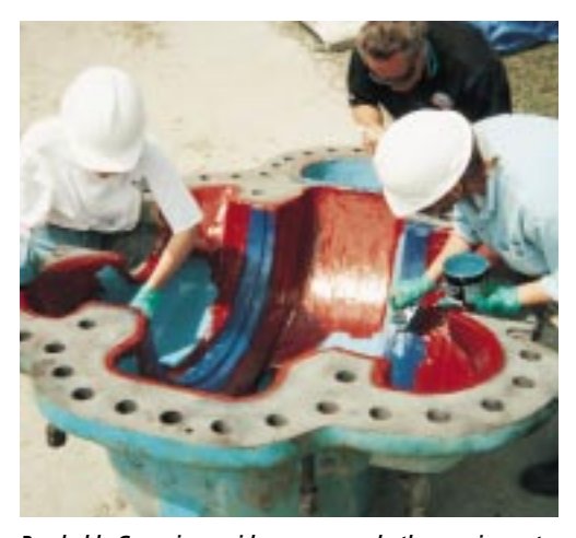
Brushable Ceramic provides pumps and other equipment with a smooth protective barrier agaist wear, abrasion, corrosion, erosion and chemical, attack, and it fills holes and voids in castings.