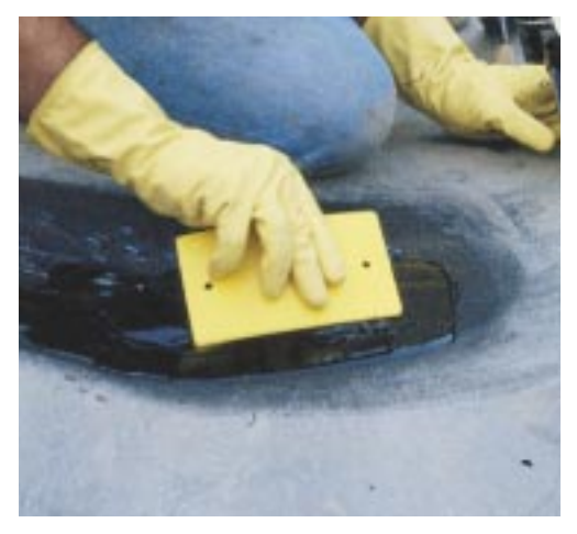
Use Flexane Putty to repair conveyor belts and rolls. It can also be trowelled on equipment surfaces to dampen sound and reduce vibration.

A highly elastic, non shrinking, water resistant compound with a Shore A 75 hardness. For making fast, permanent emergency maintenance repairs to damaged conveyor belts, rubber rollers and many other rubber or elastometric components.