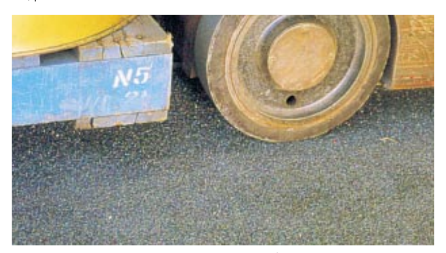
Devcon's Floor Grip Anti Skid provides a durable, non-slip surface on steel, wood or concrete, and is impervious to most liquid spills.

This durable epoxy can be used on steel , wood or concrete and produces a long lasting anti-skid surface for floors, ramps, stairs, catwalks, loading docks or anywhere a safety hazard exists. Floor Grip is easily applied by brush or roller and carbide granules are sprinkled over to provide a superb non slip finish. It is impervious to water, weather, oils, petrol and most chemicals and cures as low as 4°C.