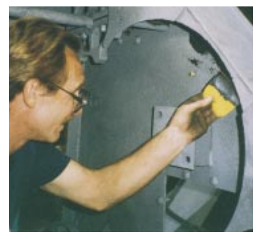
Plastic Steel, the first metal fortified epoxy repair compound is still one of the most effective for a wide range of general metal repair and rebuilding applications.

Aluminium filled, high strength bonding, patching and sealing paste that bonds to Aluminium and other metals, ceramics, wood, concrete or glass. Fasmetal 10 is ideally suited for air conditioning repairs.