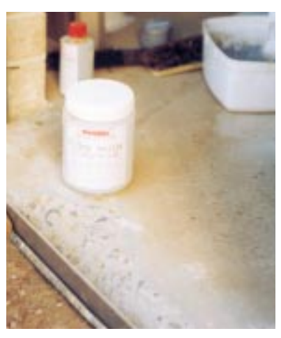
Remove all loose material and provide shoring to shape the repair by Floor Patch

This extremely versatile and high performance product has approximately three times the compression strength of concrete. It can be used to resurface old or new concrete, sealing masonry walls, excellent for filling old anchor bolt holes or anchoring machinery in concrete or masonry as it is non shrinking and non sagging. Floor Patch has good impact strength and resistance to oils, petrol, water, alkalies and acids. Sets quickly and cures overnight.