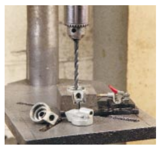
Plastic Steel Liquid offers a fast and economical way of making holding fixtures