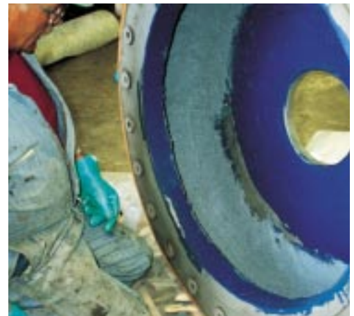
Wear Guard High Load offers an economical way to protect equipment surfaces from abrasion damage caused by particulate greater than 3mm.