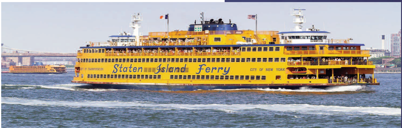
New York City Staten Island Ferry, Spirit of America, equipped with Thordon Water Quality Package and COMPAC seawater lubricated propeller shaft bearings.